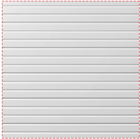
L4 600 / 600 mm